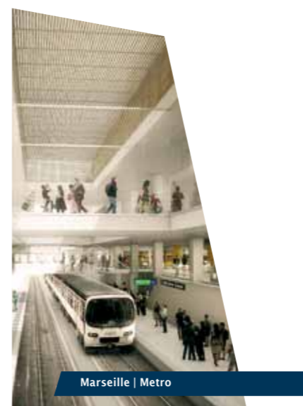
Marseille | Metro