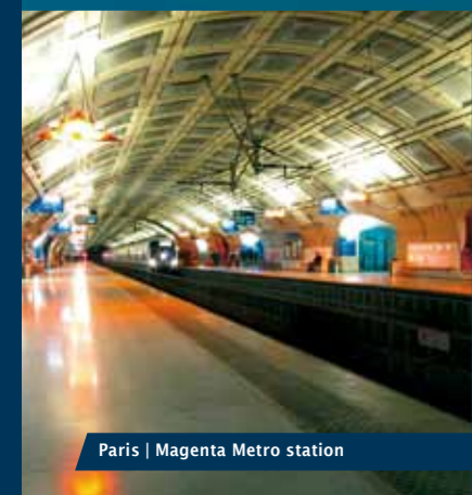
Paris | Magenta Metro station