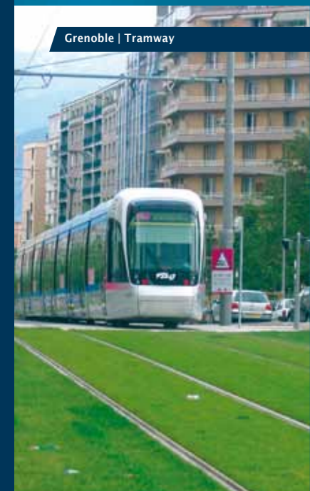
Grenoble | Tramway