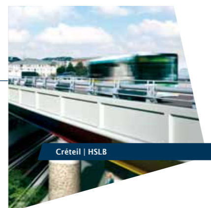
Crétail | HSLB