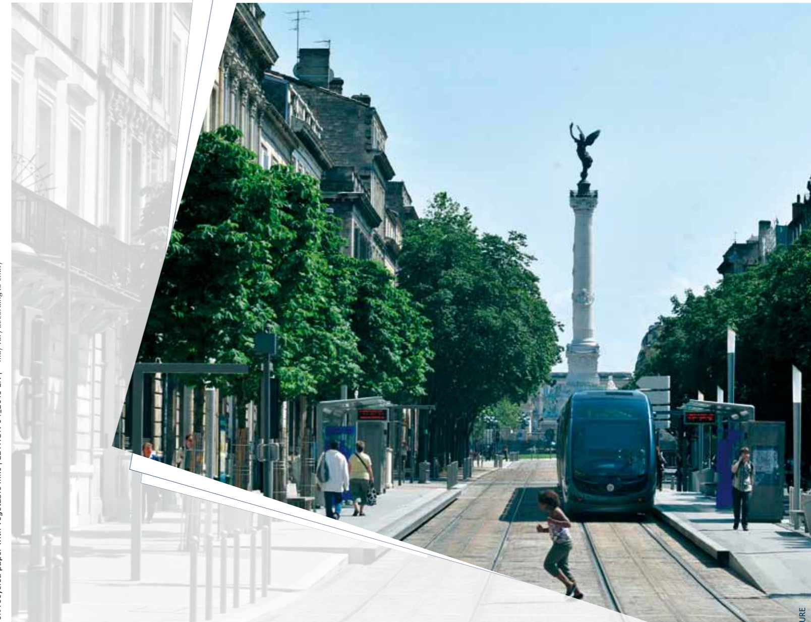
High Service Level Buses ■ Tramways ■ Metro systems ■ Trains

Graphic design: ARTELIA - V. Lavastre | Printed on 100% recycled paper with vegetable inks | EDITION 04_2013 EN | * may vary according to entity