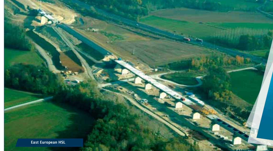
East European HSL

Artelia believes in the values of multi-disciplinary teams and most of the time works in cooperation with architecture, urban planning and landscaping firms.