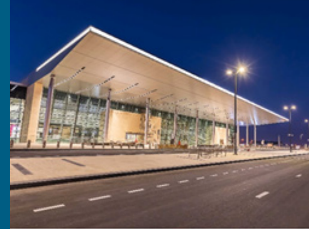
BAHRAIN AIRPORT, KINGDOM OF BAHRAIN New PTB, roads, car parks, BHS, fire fighting station