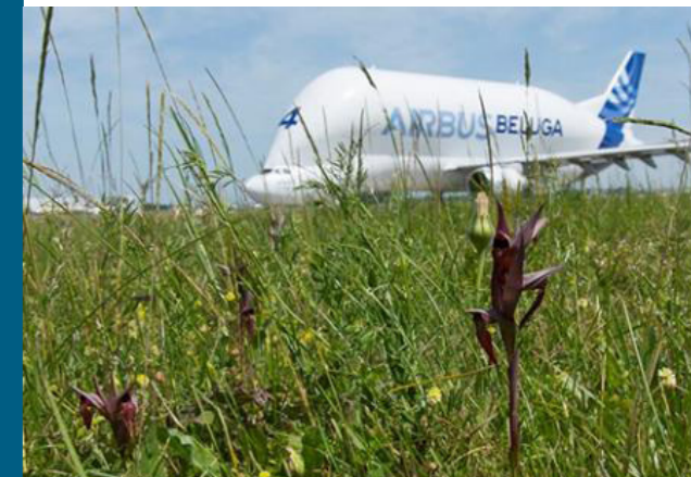
TOULOUSE BLAGNAC AIRPORT, FRANCE Natural & wildlife environment management