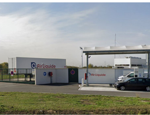
PARIS - CHARLES DE GAULLE AIRPORT, FRANCE Hydrogen filling station