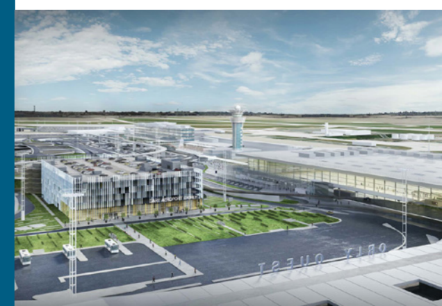
PARIS - ORLY AIRPORT, FRANCE "Orly" metro station