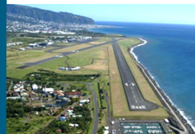
ROLAND GARROS AIRPORT, REUNION ISLAND Runway rehabilitation (ADPi & Artelia)