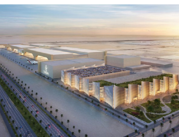
AL MAKTOUM INTERNATIONAL AIRPORT, UAE 5 triple-bay MRO hangars, 3 paint hangars