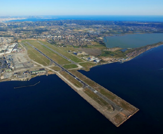
MARSEILLE PROVENCE AIRPORT, FRANCE Net zero carbon & energy self-sufficiency